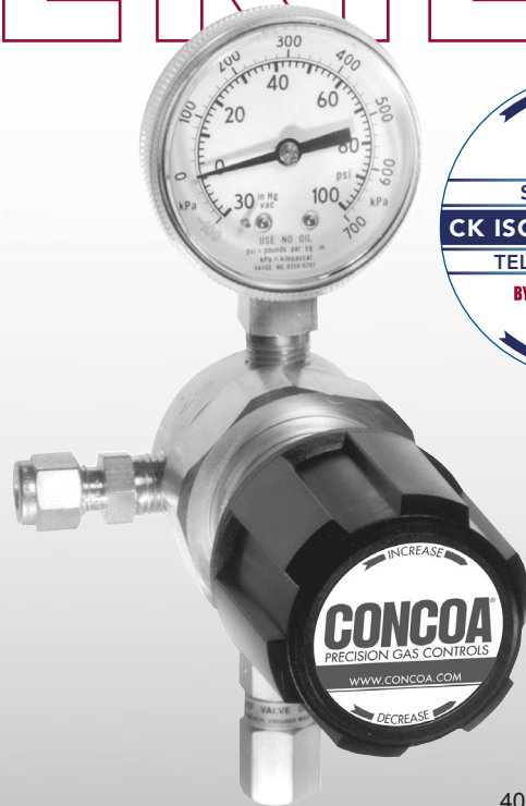
405 2021-000 shown