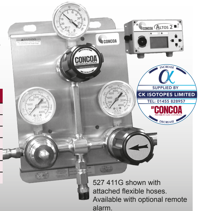
527 411G shown with attached flexible hoses. Available with optional remote alarm.