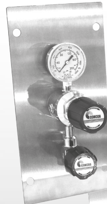
53S 5000 001 shown

The 53 Series Point-of-Use Panels provide a modular design to mount and locate 300 Series regulators at the point of use for high purity instrumentation or process gases. They are intended to provide final pressure control in gas distribution systems and are ideal for laboratory applications. The 53 Series are supplied with up to four high-purity regulators with rear entry inlet ports and diaphragm outlet valves. Five standard delivery pressure ranges can be individually selected for each regulator station 0-15 PSIG (0-1 BAR) to 0-200 PSIG (0-14 BAR).