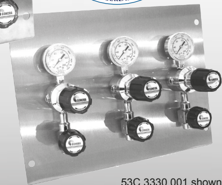
53C 3330 001 shown